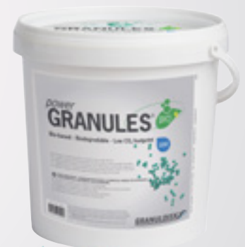
Assortment 10 liters Art.No. 26602

Worn out PowerGranules BIO are recycled as combustible waste. The packaging is made from 40% recycled material (Polypropylene) and can be recycled as plastic waste.